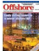
Table of Contents Past Issues